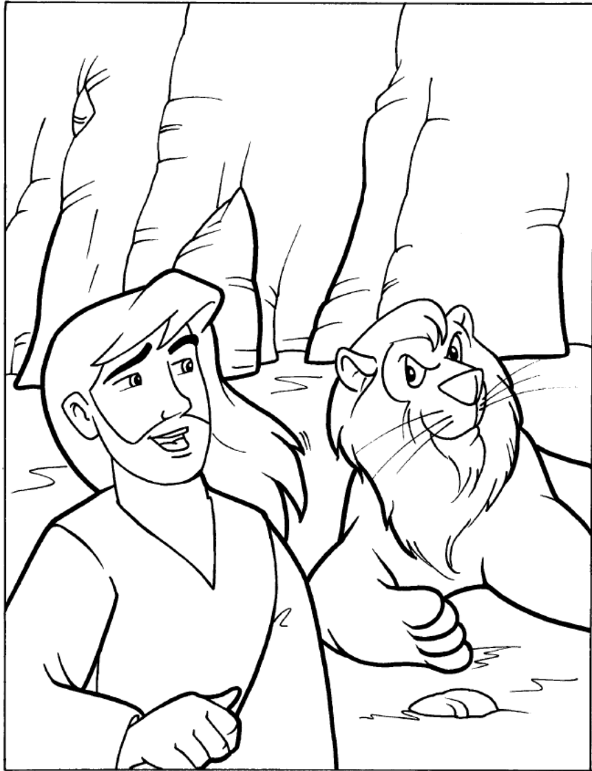
Daniel in the Lions' Den

Copyright © CalvaryCurriculum.com Used by Permission