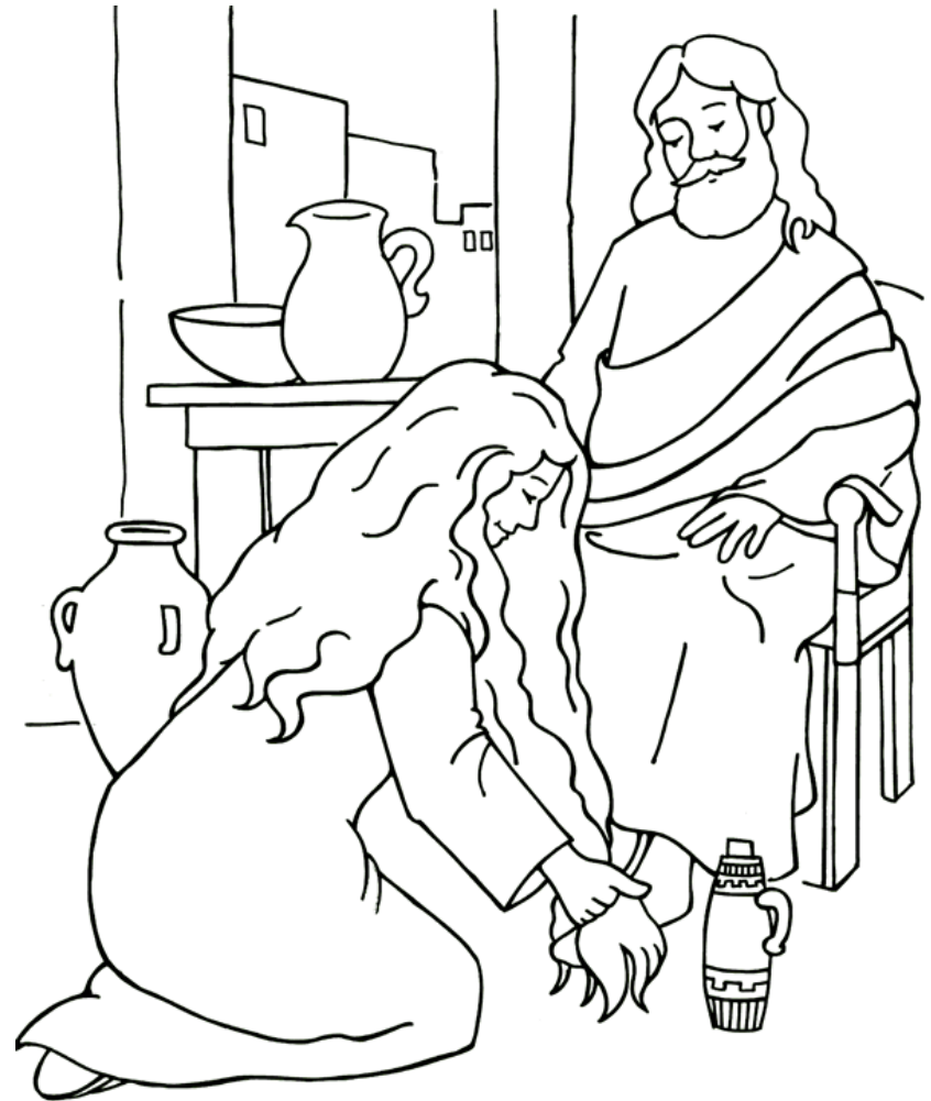
Jesus Forgives a Woman Luke 7

From Thru-the-Bible Coloring Pages for Ages 4-8. © Standard Publishing. Used by permission. Reproducible Coloring Books may be purchased from Standard Publishing, www.standardpub.com , 1-800-323-7543.