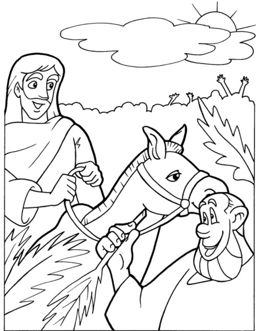
The Triumphal Entry into Jerusalem